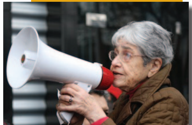
Holocaust survivor Hedy Epstein speaks out against the Wall and the occupation.